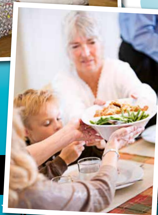
Homestays are a great way to improve your language skills and experience English family life