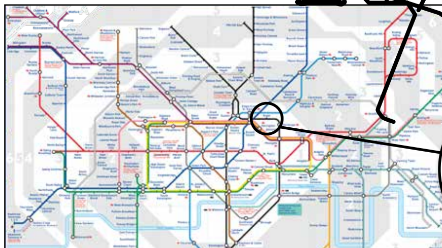
Location and building