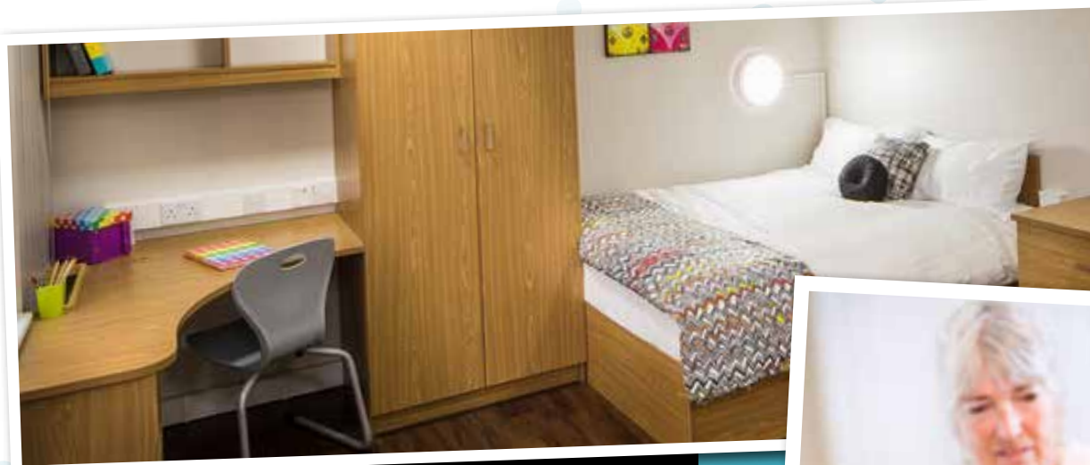
Student residence: room shown is single with en suite bathroom at Tufnell House.

ICE will book accommodation with a current booking fee of £40 per student.